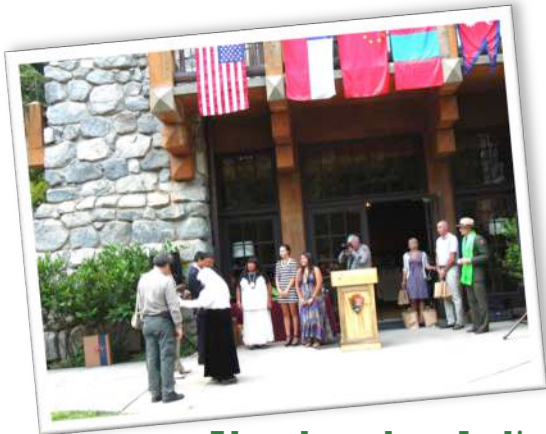
Ahwahnechee Indian Gift Delegations

I will be attending the World Parks Congress in Sydney, this November. It will be important for us to get the IRF message out to the delegates. Our President, Secretary, and Australian rangers are working hard to put an excellent program together.