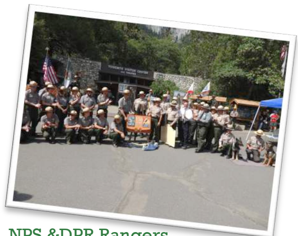
NPS & DPR Rangers & 150 th Sign

I continue my work with the next World Ranger Conference Committee, please read their report. I have been contacted by H.O.P.E. (Humanitarian Operations Protecting Elephants)