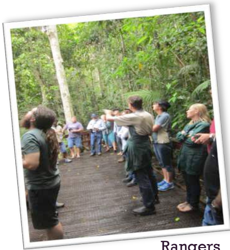
Our hosts, the