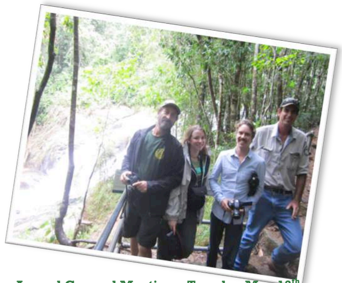
Annual General Meeting – Tuesday May 13 th 2014 Genazzano's Rainforest Retreat – Lake Tinaroo, Queensland

Queensland Rangers Association provided a thought provoking range of presentations from branding, to wildlife rehabilitation, onground Park works programs and peer support services. The trade show once again provided a great opportunity for rangers to consider what products and systems are on offer to help achieve greater Park use and conservation goals. A field trip around the Crater National Park on the Atherton Tablelands gave attendees the opportunity to