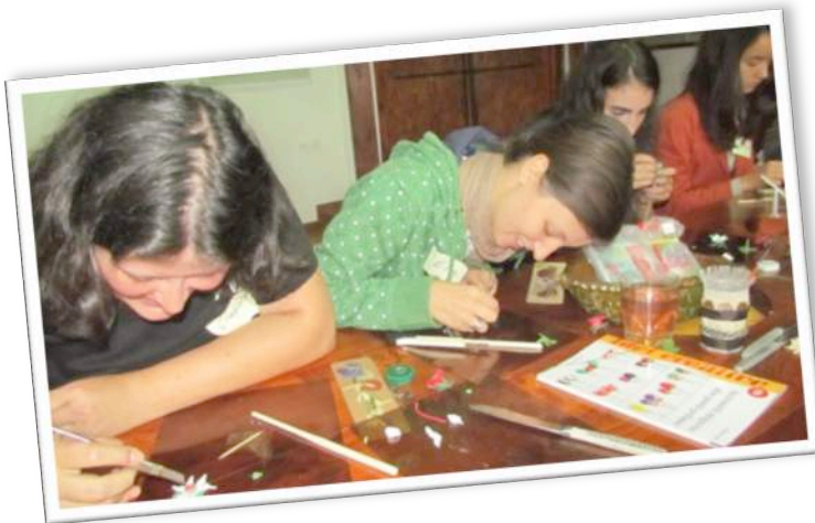
Some souvenirs for tourists