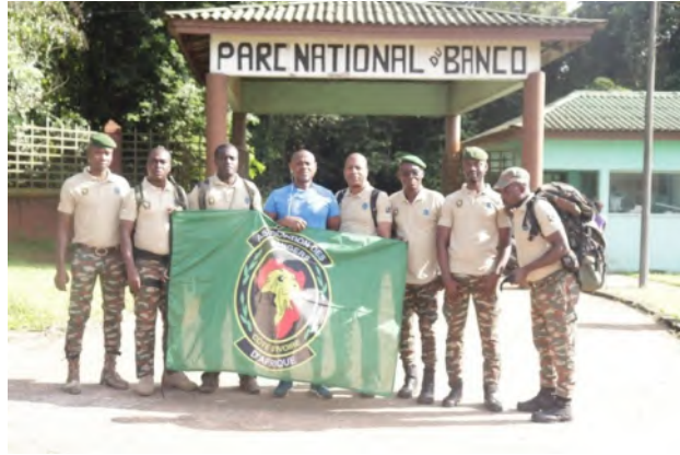
The Cote d'Ivoire ranger team competing in the Wildlife Ranger Challenge