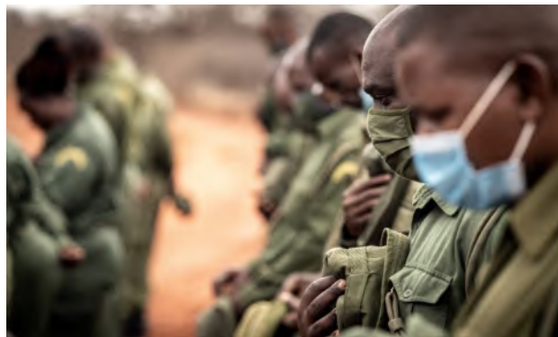
Image credits: Photo credit: LEAD Ranger of the team at Wildlife Works honouring two recently fallen comrades on World Ranger Day, 2021.

These reports are shared with the International Ranger Federation and relevant details are recorded for the Roll of Honour of Fallen Rangers.