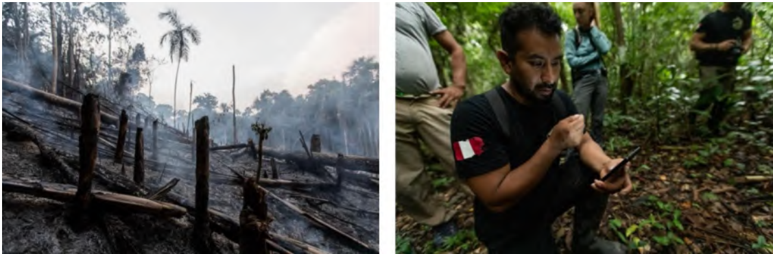
Illegal agricultural invasions, slash & burn of future farmlands.

During the last few months, as the rainy season came to an end, there has been an increase in illegal activities such as agricultural groups invading forestry concessions and unauthorized brazil nut harvesting, a product from primary rainforest. Junglekeepers' rangers have been monitoring the forest along the river and reporting illegal activities to the proper authorities. Our team of rangers are keeping the area they are protecting safe for thousands and thousands of species of wildlife.