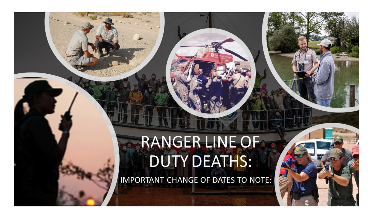
Image credits: IUCN Protected Areas, North America Park Law Enforcement Association, German Ranger Association and European Ranger Federation: