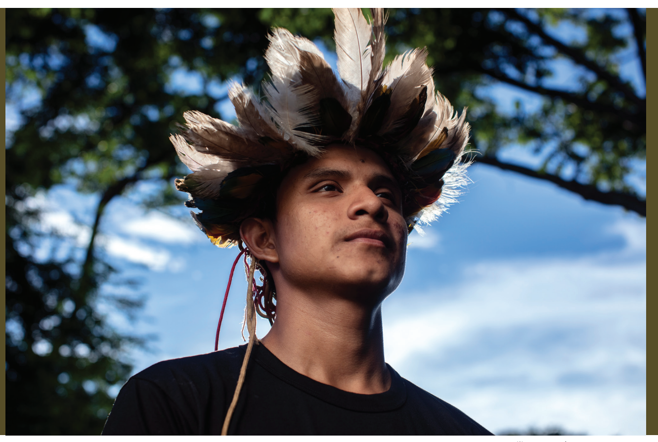
Brazilian ranger

Adequate numbers of competent, well-resourced, and well-led rangers are the foundation for effective management of most protected and conserved areas. The International Ranger Federation (IRF) defines "ranger" as a person involved in the practical protection and preservation of all aspects of wild areas, historic