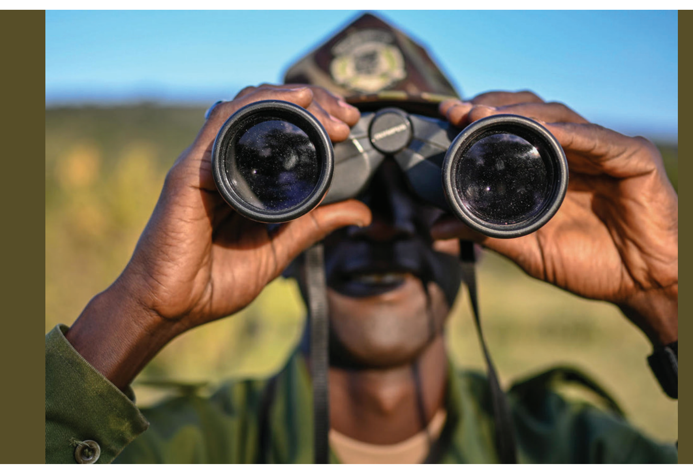
Kenyan ranger

Indigenous people and local communities and rangers are built, safeguarding all parties, and increasing collaboration, dialogue, and transparency.