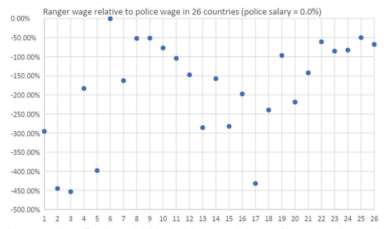
Figure 1. Ranger vs. police wage differential in 26 countries (Belecky et al. 2019). The other two countries that were part of the survey, Russia and China, were excluded from the analysis because the survey was not delivered at a national scale in them.

Considering that both police and rangers are public-sector employees tasked with enforcing and upholding the laws of the countries in which they work, the pay disparity should be seen as potentially damaging—both to the status of the sector (and its ability to recruit talent), and to perceptions of value and importance rangers associate with their own work and organizational goals. This comparison with police officers is further relevant in that there is no occupation more likely to drain rangers from the field, or to be compared with if rangers are going to lobby for wage increases.